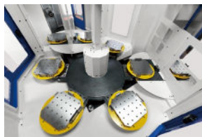
2APC → 8APC